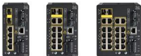
Figure 1. IE-3100 Rugged Series switches models